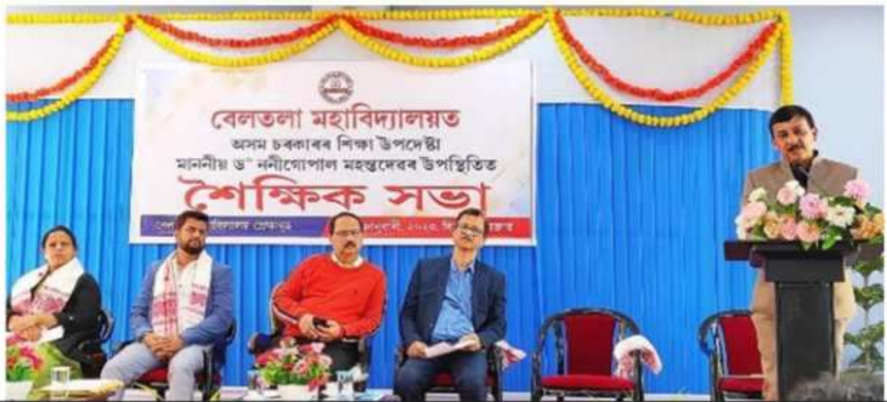
Adviser, Hon'ble Minister, Education, Dr Noni Gopal Mahanta at Beltola College