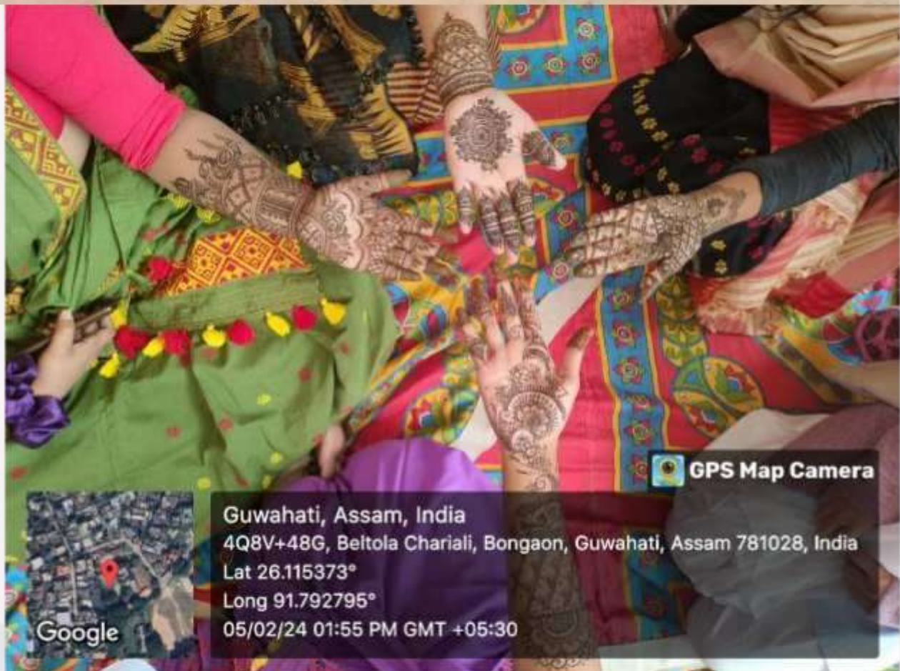
Glimpses of the Sports and Cultural Week