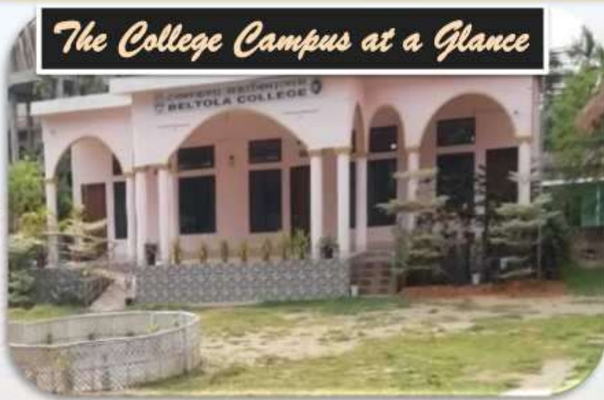
The College Campus at a Glance