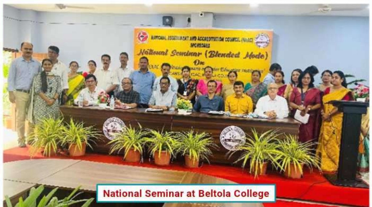
National Seminar at Beltola College