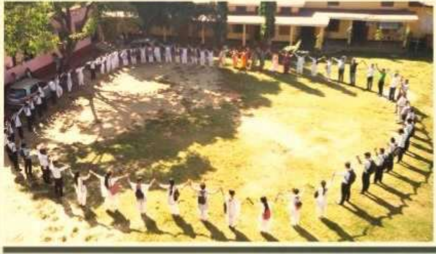
Human Chain (a Symbol of Unity) by the College Students & Faculty Members