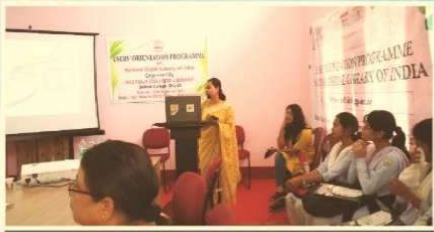
Orientation Programme on National Digital Library of India organized by the College Library