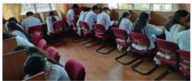
Students reading in Beltola College Library