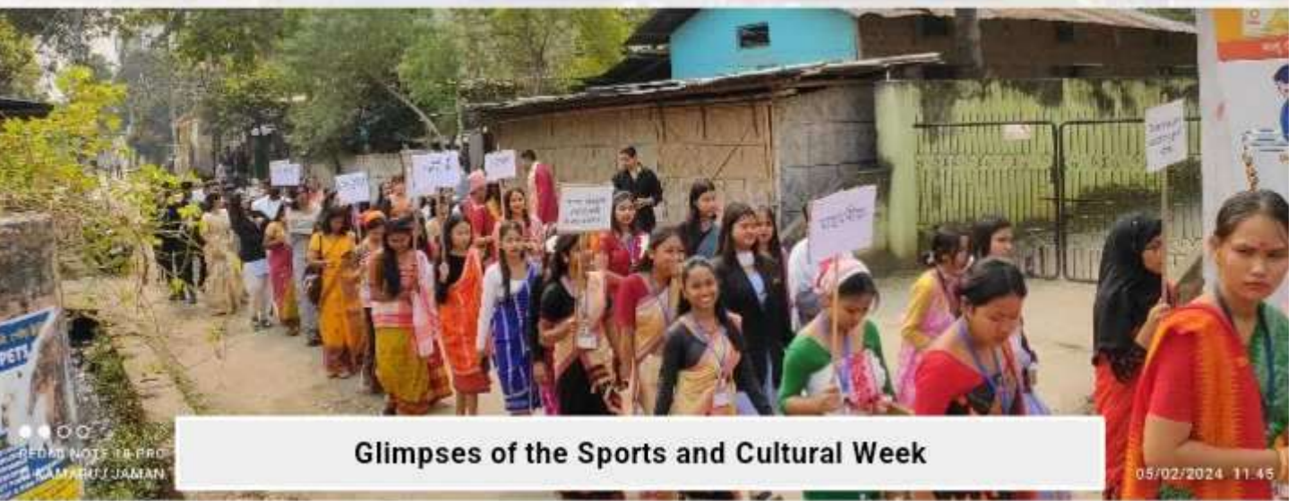
Glimpses of the Sports and Cultural Week