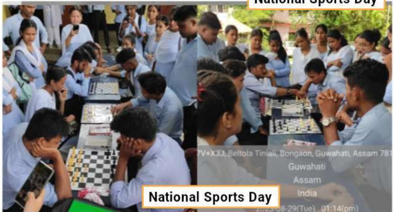
National Sports Day

7V+X3J, Beltola Tiniali, Bongaon, Guwahati, Assam 781 Guwahati Assam India 2023-08-29(Tue) 01:14(pm)