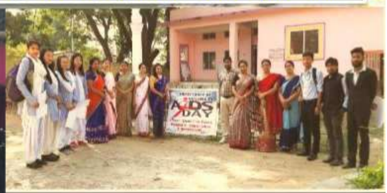
Observation of World AIDS Day at College