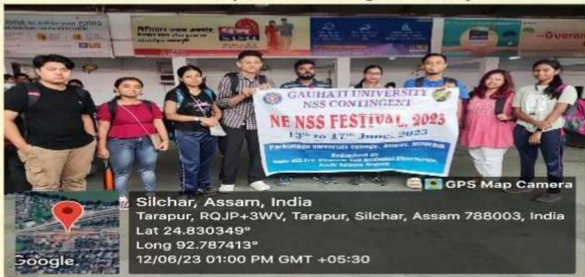
National Programme of NSS team from Assam