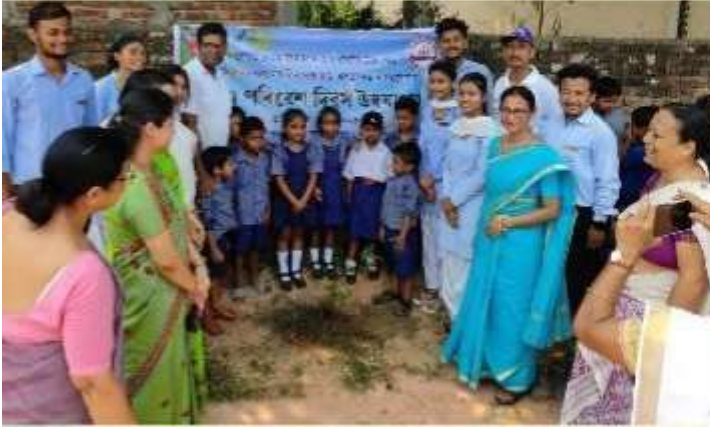
Plantation Programme at the College Campus on World Environment Day

Swachh Bharat Abhijan, International Women Day, Workshop on Making Pickles, Jam, Jelly, published an annual journal entitled as 'Swetabhuja' and adopting several welfare programme for the development of the society.