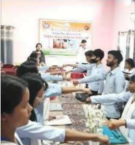
Pledge Taking : Mera Pehla VOTE Desh Ke Liye