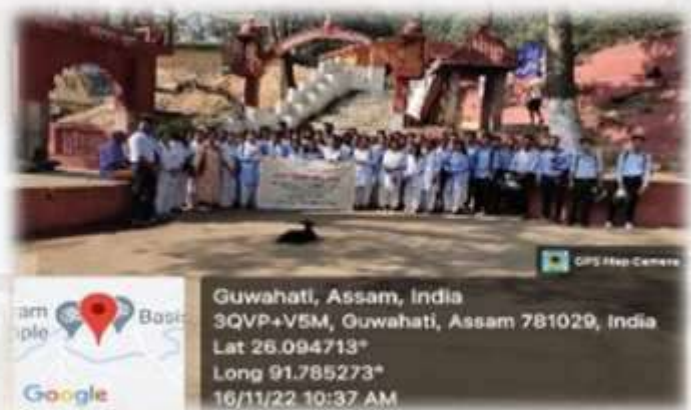
Field Trip and Excursion organized by the College