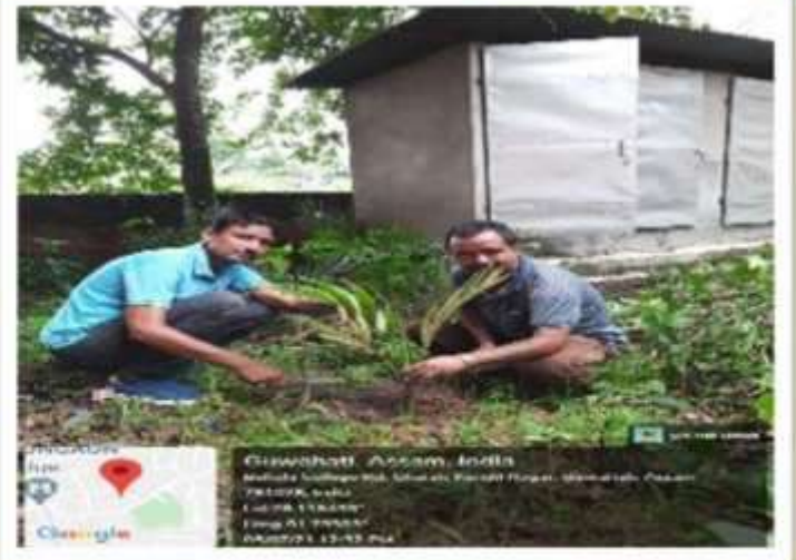
Various Programme organized by NSS Unit of the College