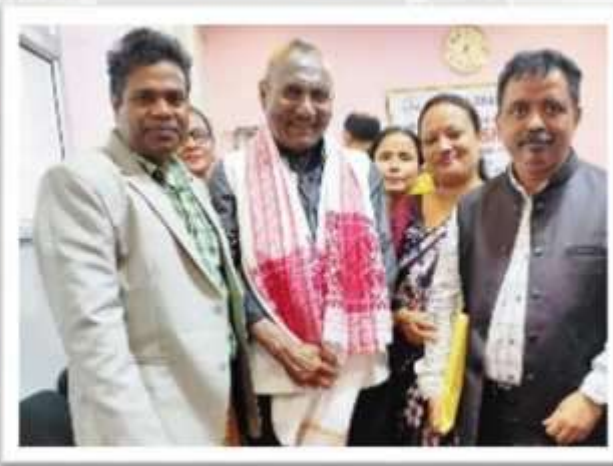
Guest of the Month Programme at Beltola College