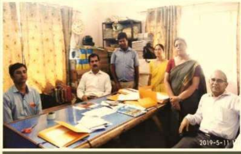
Deputy Controller of Examinations & his team from Gauhati University visited the College on 11 th May 2019