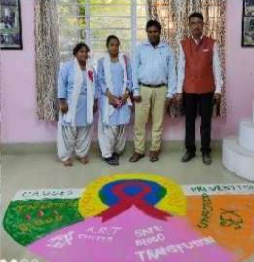
Say "NO" to AIDS, STD World AIDS Day Celebration