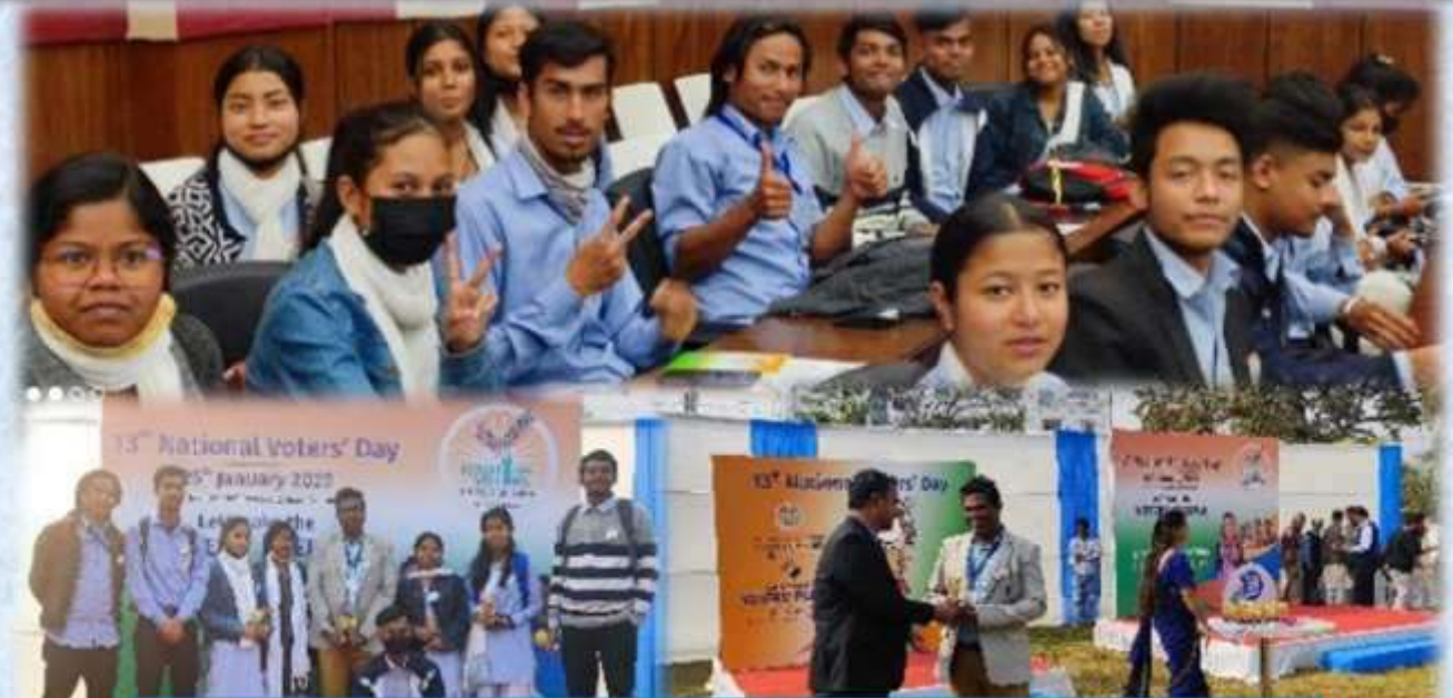
Students of Beltola College attended National Voters' Day