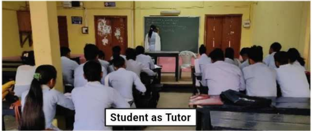
Student as Tutor