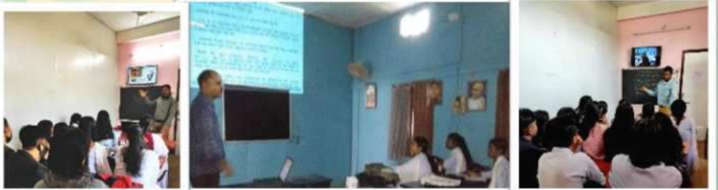
Faculty Member of the College taking a Smart Class

❑ Smart classroom: The College has provided smart classroom facilities to upgrade the students digitally. The students can acquire the visual knowledge through internet and other digital applications.