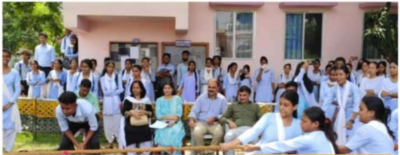
National Sports Day