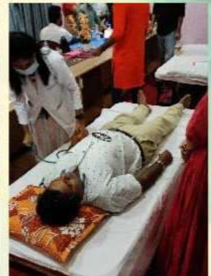
Blood Donation Camp organized at Beltola College