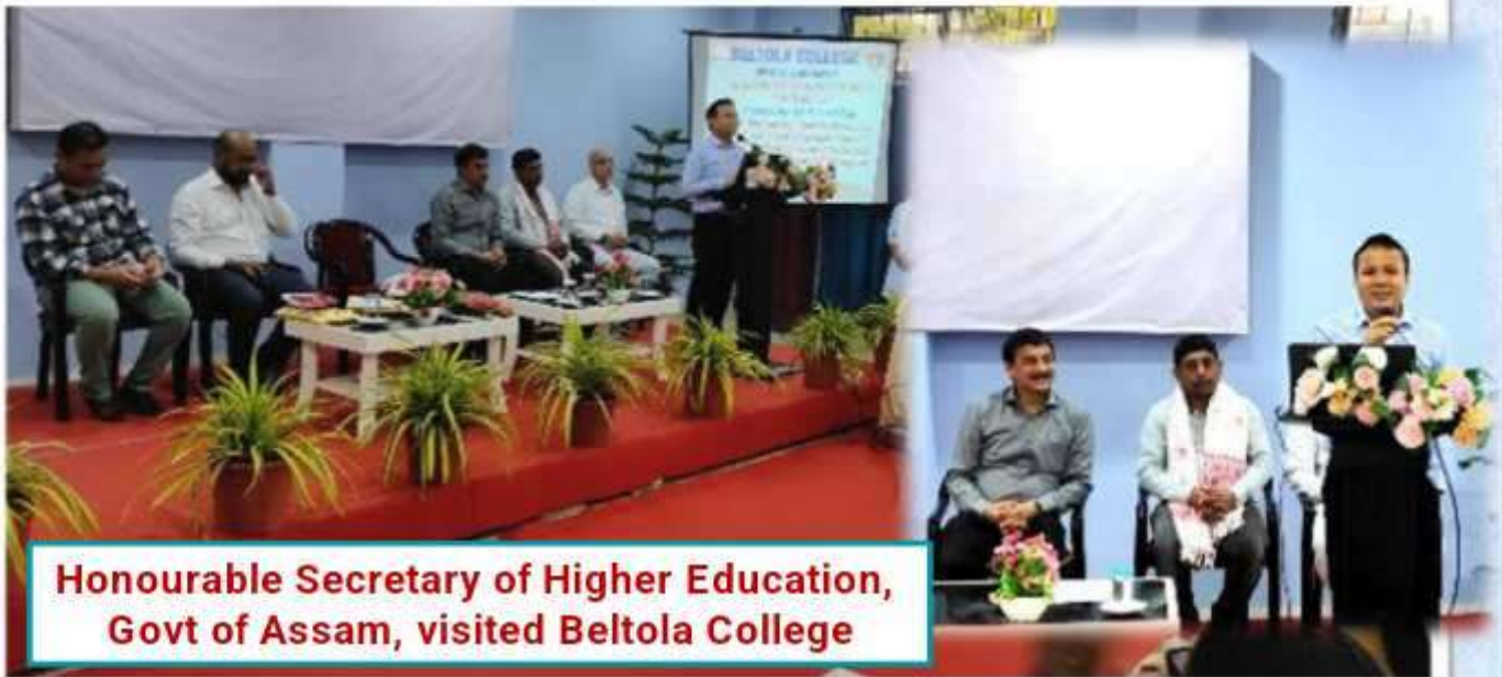
Honourable Secretary of Higher Education, Govt of Assam, visited Beltola College