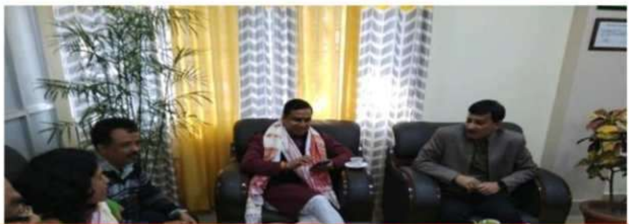
Hon'ble Minister Public Health Engineering, Skill, Employment & Entrepreneurship, Tourism JAYANTA MALLA BARUAH visits Beltola College