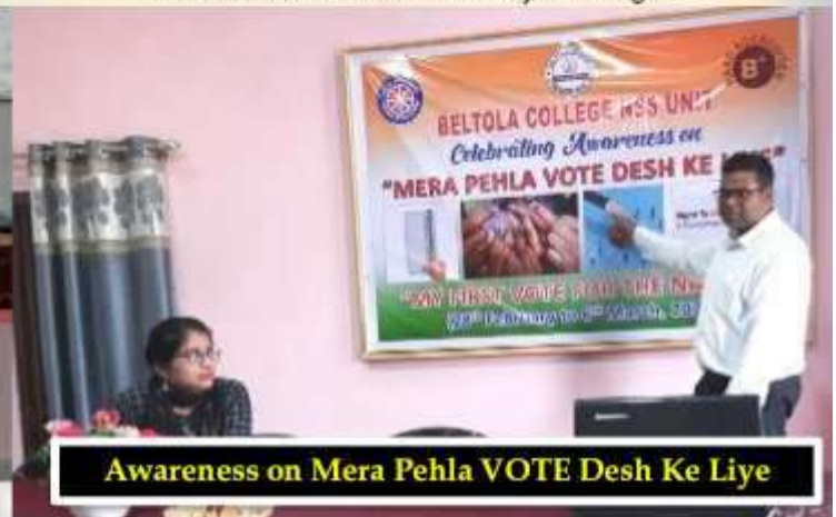
Awareness on Mera Pehla VOTE Desh Ke Liye

©2021 Beltola Chariali, Bongaon, Guwahati, Assam 781028, India Guwahati Assam