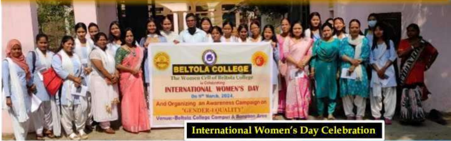
International Women's Day Celebration