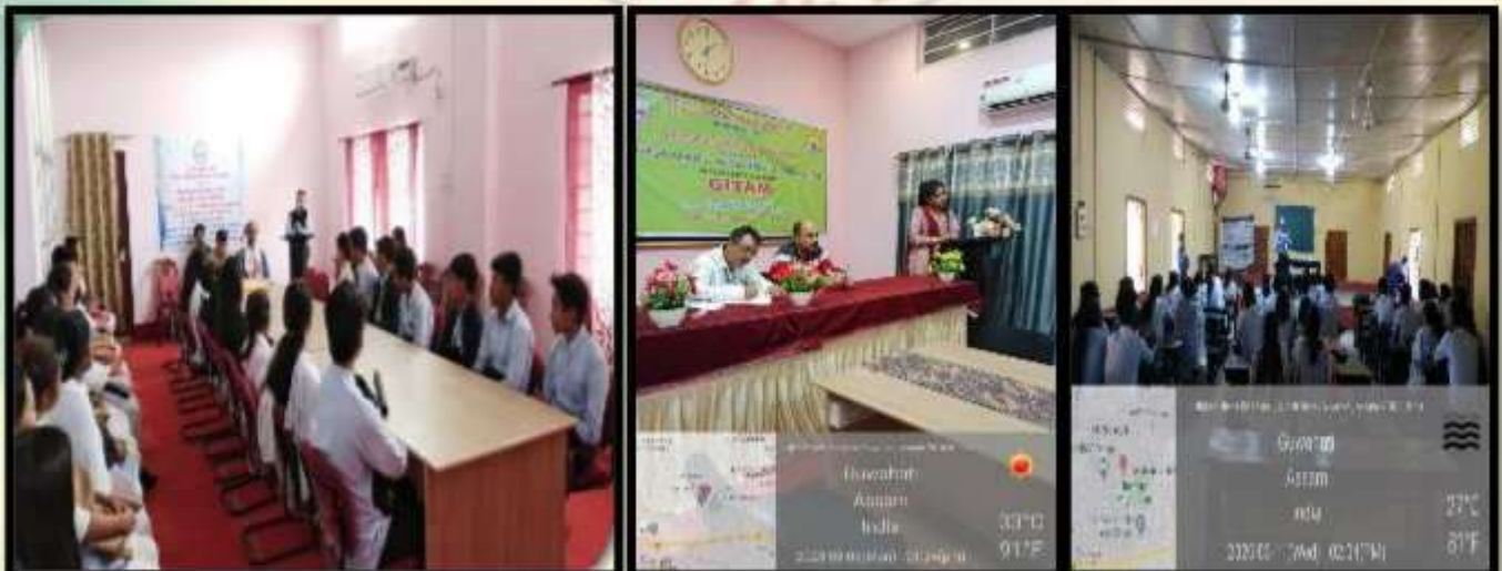
Activities of Career Guidance Cell

❑ CAREER GUIDANCE CELL : This cell was established on 17-05-2015. The objectives of this cell are to address the diverse social economic challenges and geographical background of heterogeneous population and provide institutional support and placement accessibility. The functions of this cell are organizing and keeping records of indoor and outdoor game, arranging Spoken English Classes and availing knowledge about different career, taken classes for personality development, organizing and encouraging co-curricular activities, arranging training programme for computer literacy for the students and staff of the college, collecting feedback system and take necessary steps.