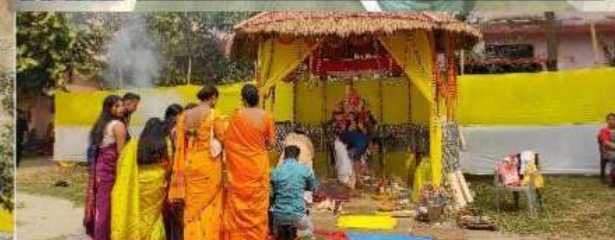
Saraswati Puja at Beltola College