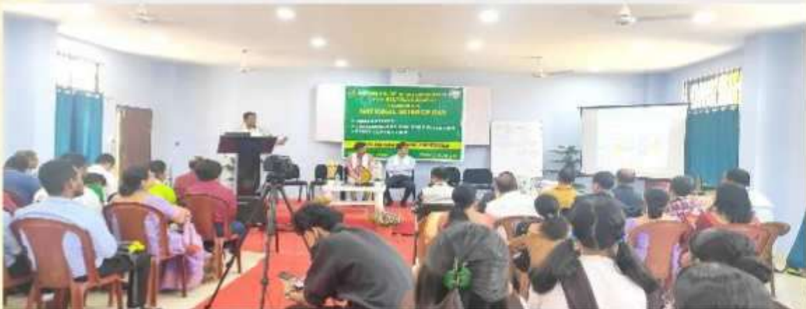
Vigyan Aalaap a well-known NGO in collaboration with Beltola College