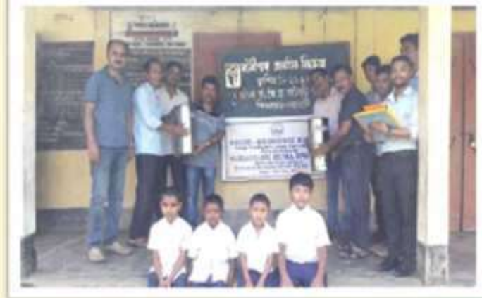
Community Development Cell organized a Socio-Economic Survey at the adopted village of College Katakypara and donated water purifier for benefit of LP School students

❑ Community Development Cell : For the social responsibility of this institution, the community development cell involve in adoption of village and take measures for the development of such Village, adoption of school, take measures for the development of such school, organizing different awareness camp such as awareness about land erosion, health, literacy etc. Besides these, it also organises community development programme. It was established on 17.05.2015.