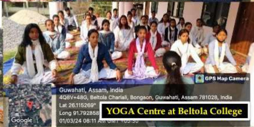
YOGA Centre at Beltola College