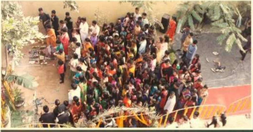
Students are present on the occasion of 'Nirmali' on Saraswati Puja