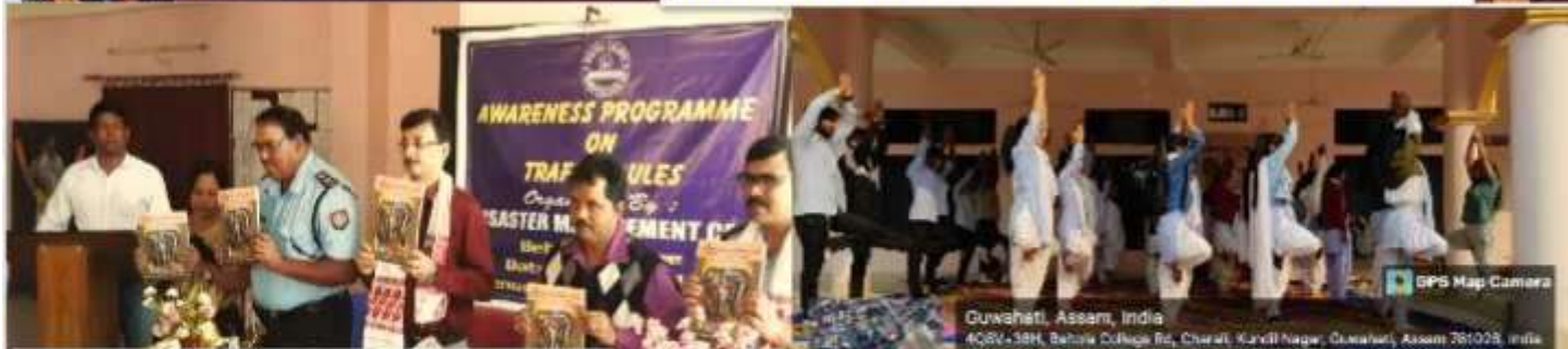
Awareness Programme on Traffic Rule by Disaster Management Cell