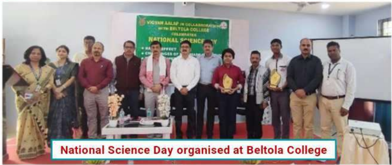
National Science Day organised at Beltola College