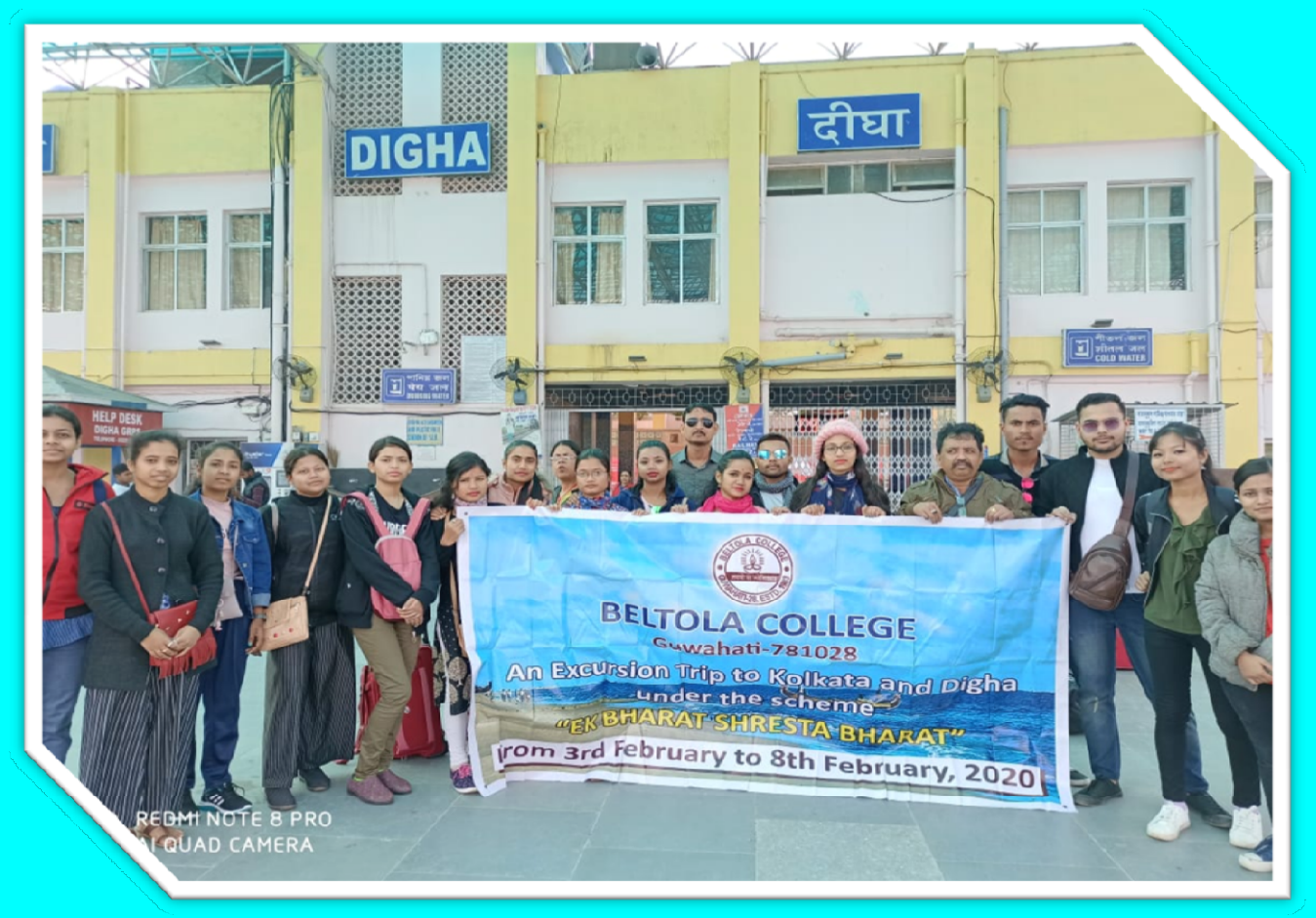
An Excursion- Trip to Digha and Kolkatta