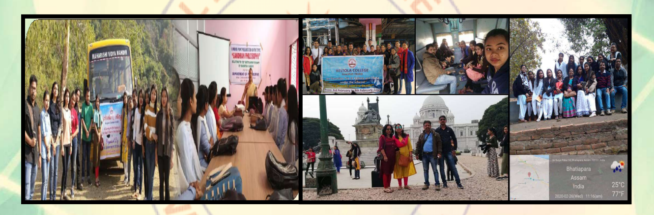
Field Trip and Excursion organized by the College