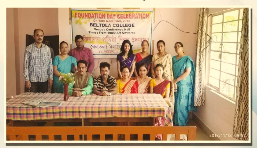
College Foundation Day Celebration