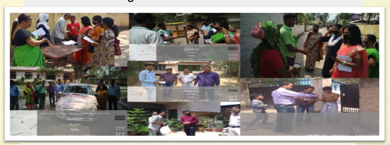
Covid- 19 awareness program