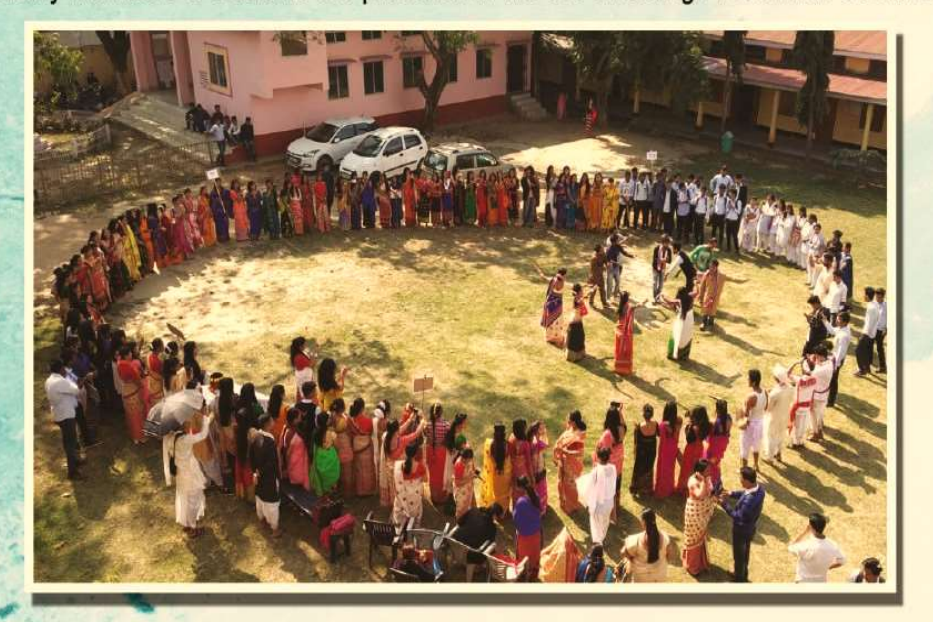
Cultural Programme held at the College Week Festival