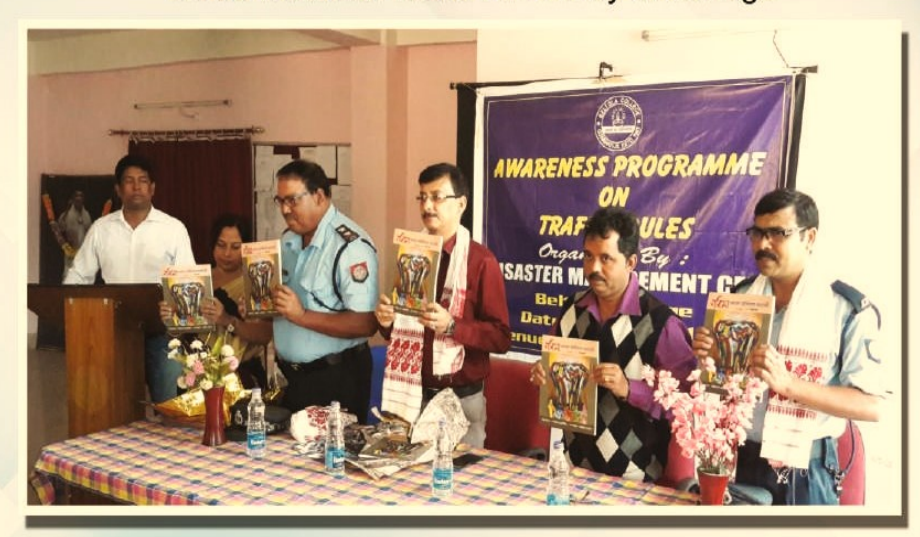
Awareness Programme on Traffic Rules for Students held at College