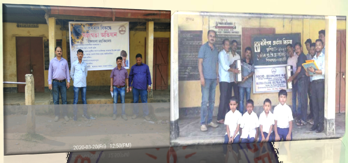
Community Development Cell organized a Socio- Economic Survey at the adopted village of College Katakypara and donated water purifier for benefit of LP School students

□Community Development Cell: For the social responsibility of this institution, the community development cell involve in adoption of village and take measures for the development of such Village, adoption of school, take measures for the development of such school, organizing different awareness camp such as awareness about land erosion, health, literacy etc. Besides these, it also organises community development programme. It was established on 17.05.2015.