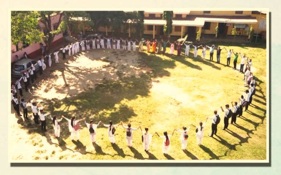
Human Chain (a Symbol of Unity) by the College Students & Faculty Members