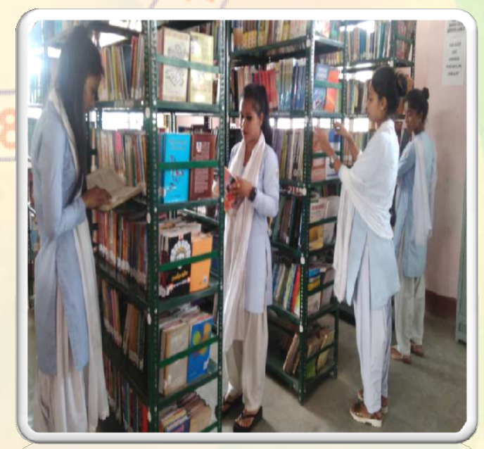
Users' Searching books in the College Library

□Library: The College has a wellorganised library with a collection of text books, reference books and other valuable books related to different subjects. A good number of Journals, Magazines/ Periodicals and Newspapers are also stocked in the library. Students are issued one library card which should be renewed yearly. Library orientation programme is organised for the newly admitted students. The library has Library Management Software SOUL 2.0 for the automation of the house keeping operations of the library. The library provides access to E-resources through NLIST (National Library and Information Services Infrastructure of Scholarly Content) programme. The library offers spacious reading hall along with internet and reprography facility.