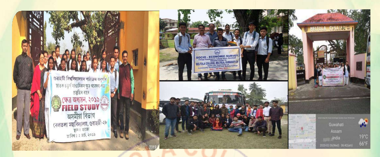
Field Study organized by the Department of College