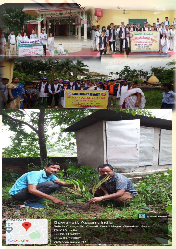
Various Programme organized by NSS Unit of the College

□ Environmental Awareness Cell: It is one of the active cell in Beltola College working for Environment upliftment. This cell tries to thrive for creating awareness among the students and communities, so that we can live in a better world. Various plantation programme and world environment day is observed every year by this cell.