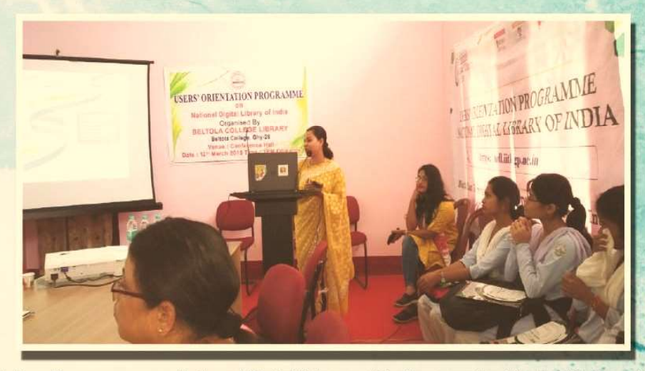
Orientation Programme on National Digital Library of India organized by the College Library