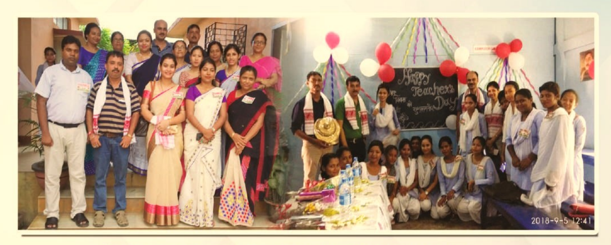
On the occasion of Teachers' Day Celebration