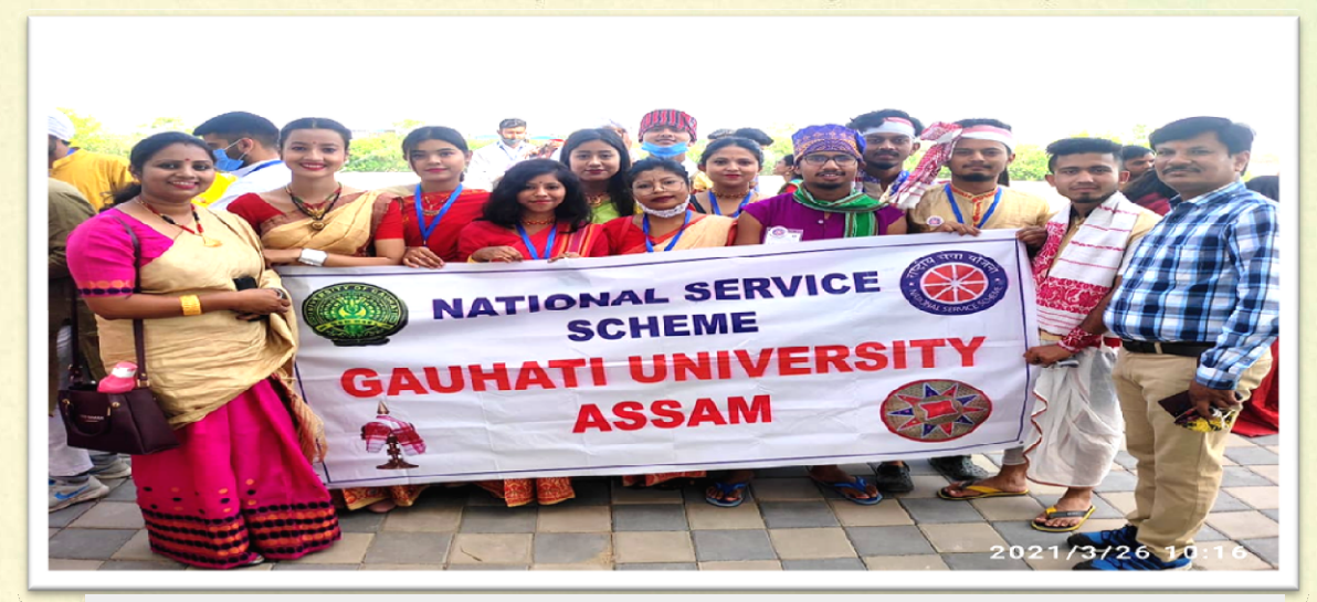
National Programme of NSS team from Assam