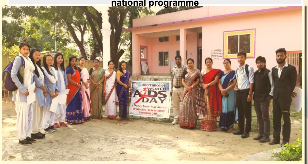
Observation of World AIDS Day at College

Two NSS volunteers from our institute had participated in the national programme